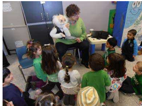
JCC celebrates Tu B'Shevat