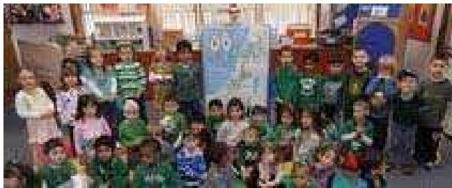
Tu B'Shevat celebration with Blue Box and Davi the Dog